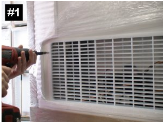
Remove screws from side cover and remove, pulling out top edge first.

Electrical Hazard – Always disconnect from the power source BEFORE changing a thermostat!