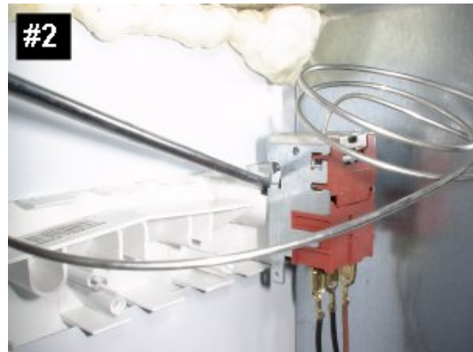
Use screw driver to pry out knob. The knob should slide off fairly easy. Only pry it our far enough (about 1/4 inch) that it can be removed by hand from the front of the unit.